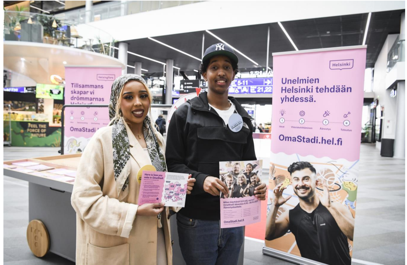
Voting venue in Mall of Tripla 2021.