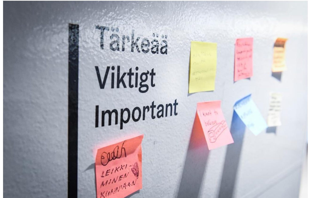
Workshop Starttiraksa 4.3.2020 at Oodi library.